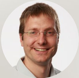
Alex Kitt Computed Tomography (CT), Optical Metrology, and Vision Systems